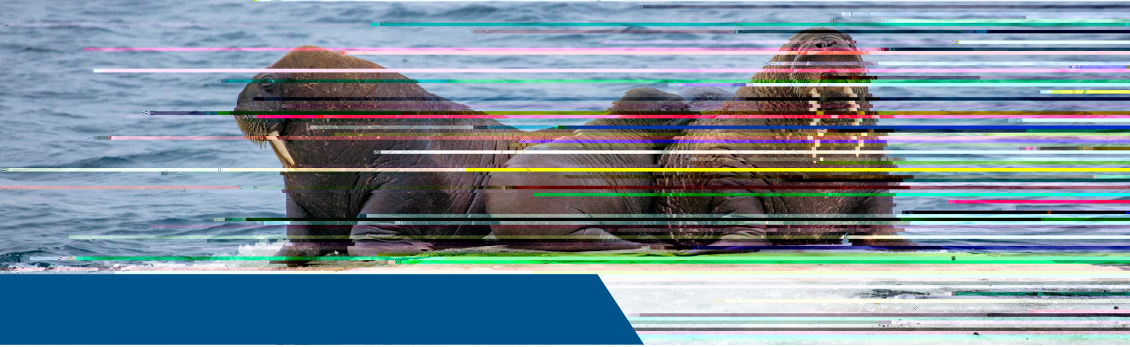
Walrus rest on sea ice in the Arctic.